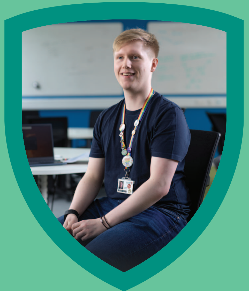
PhD student BSc Software Engineering Graduate