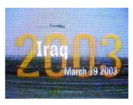
Figure 3. Visual representation of 'what is going on in the world'

The clause is later picked up in the film by the reporter and deployed in the same abstract context of nominalisation that denies the relation of British policy to global politics<sup>2</sup>.