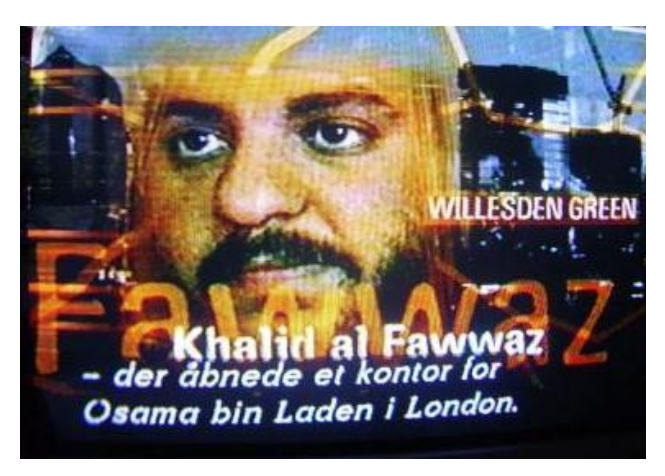
Figure 2. The hypemediated iconicity of London as a hub, or 'Londonistan'

As an operational centre, London establishes a high sense of immediacy towards the viewer; it is a zone of risk.