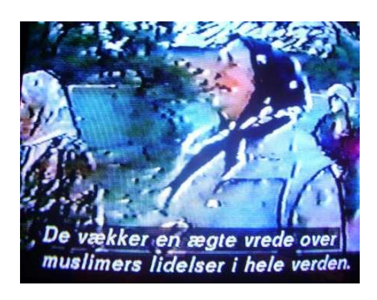
Figure 4. Hypermediacy through anachronic and anatopic juxtapositions: mystification of suffering