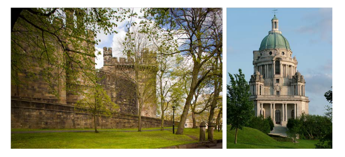
Lancaster Castle (left) and The Ashton Memorial (right)