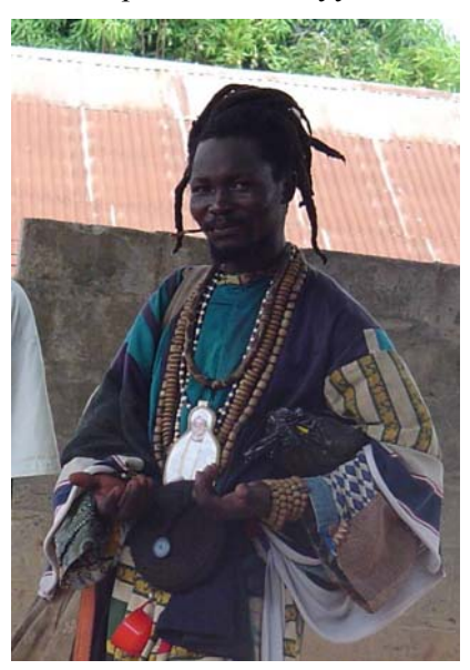
Figure 2. A Baye Fall Disciple of the Muridiyya Brotherhood. Ziguinchor, Senegal.