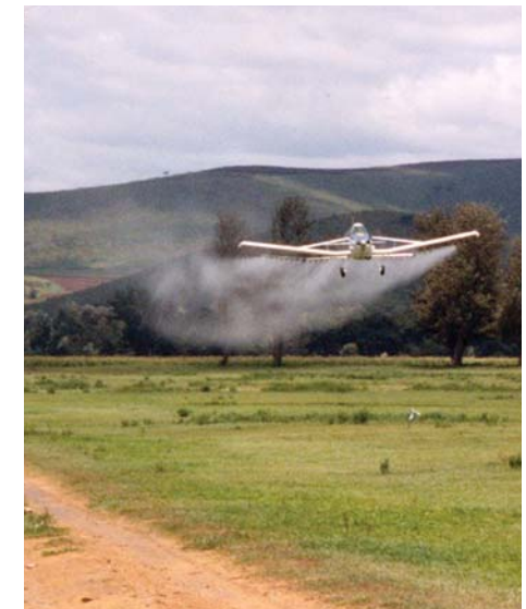
Aerial spraying of NPV