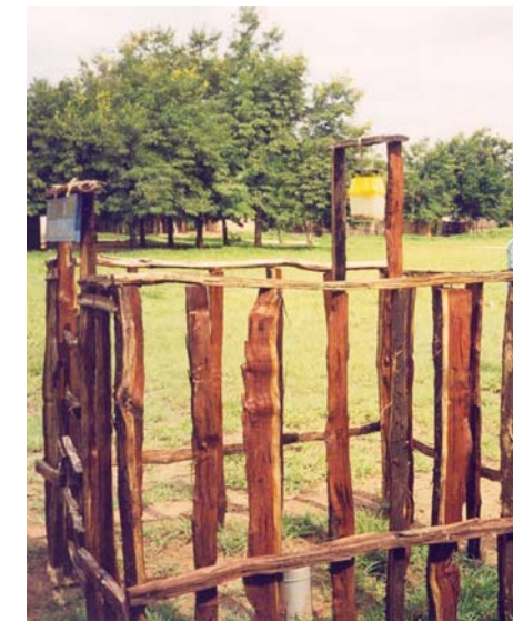
Community pheromone trap