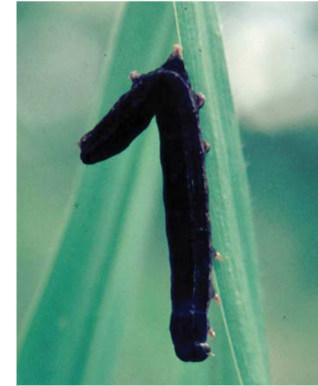
Armyworm killed by NPV. Dead insects can be seen hanging from plants

Research to validate this strategic approach is already under way by a consortium involving the Natural Resources Institute, UK, Eco Agriconsultancy Services Ltd, Tanzania, Sokoine University of Agriculture, Tanzania, Lancaster University, UK, and the Pest Control Services of the Tanzanian Ministry of Agriculture and Food Security. This is funded by the UK's Biotechnology and Biological Sciences Research Council and Department for International Development (DFID).