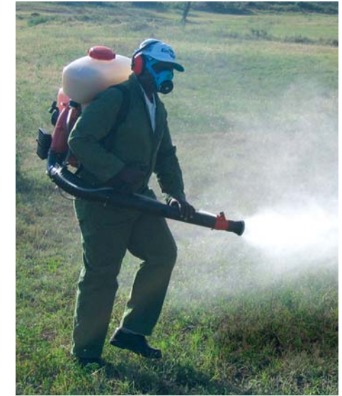
Ground application of NPV