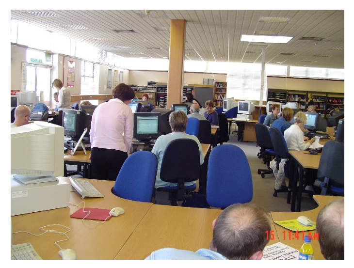
Figure 2: College Learner Development Centre

We will focus upon the interaction between informal vernacular literacy practices grounded in for example family: