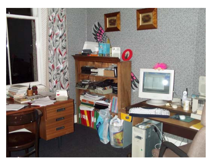
Figure 3: Study Bedroom

We will focus upon the interaction between informal vernacular literacy practices grounded in for example family: