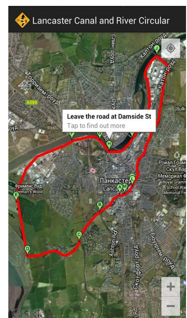
Screen-shot of the Lancaster Pathfinder App developed via a Student Project

With no fee, student projects are highly cost-effective . Any major costs resulting from the work carried out are identified and agreed as part of the planning stage. In addition, we request that clients reimburse the students for out of pocket expenses directly resulting from the project (e.g. travel to visit sites).