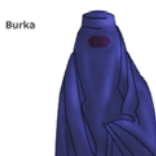
Figure 2. Burka (Burqa)

1.1.1.2. Burka is the most concealing of all Islamic veils. It covers the entire face and body, leaving only a mesh screen to see through.