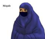
Figure 3. Niqab