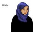
Figure 1. Hijab

1.1.1.1. Hijab: The word 'Hijab' is usually a term used for covering the hair. It is an Arabic term meaning 'barrier' or 'partition'. According to Bardan (1995c,P.22) "the word 'Hijab' or 'veil' signified covering the face and was used as a generic term in nineteenth and early twentieth century Egypt". The type most commonly worn in the West is a square scarf that covers the head and neck but leaves the face clear.