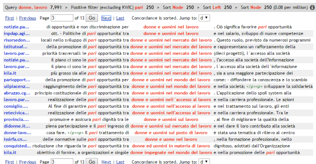
Figure 2. A sample of concordance lines of pari [equal]

In the itTenTen corpus, the word pari [equal] occurs 250 times (0.08 pmw) as collocates of the sequence donne, lavoro [women, work]. By analysing a sample of 100 occurrences, the word pari refers 82 times to opportunità [opportunities].