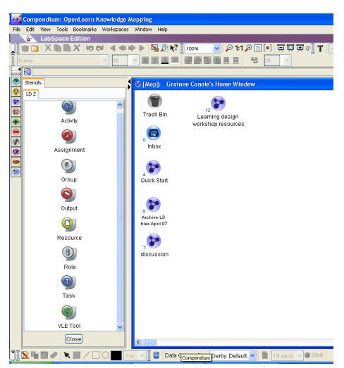
Figure 1: Screenshot of Compendium with the LD2 learning design stencil set of icons

Figure 1 provides a screenshot of Compendium, showing the generic set of icons on the far left-hand side, along with our initial learning design stencil set and the user workspace. Compendium comes with a predefined set of icons (question, answer, map, list, pros, cons, reference, notes, decision, and argumentation). The creation of a map is simple, users drag icons across and can start to build up relationships between these through connecting arrows. Each icon can have an associated name attached with more details contained inside the node, an asterisk appears next to the icon and if the user hovers their mouse over this the content inside the node is revealed. Other types of electronic files can also be easily incorporated into the map such as image files, Word files or PowerPoint presentations. The reference node enables you to link directly to external websites. Icons can also be meta-tagged using either a pre-defined set of key words or through user generated terms. Maps can be exported in a variety of ways from simple diagrammatic jpeg files through to inter-linked web pages.