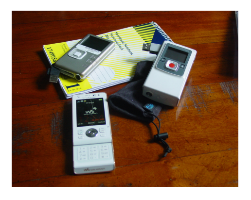
Figure 1: Day Experience Kit.

The data reported here is largely confined to universities A, B, D and E as these were all place-based and the distance students at university C had significantly different study patterns and usage of ICT for study purposes and in their social life and leisure (see Ramanau et al 2010). Our focus in this paper is on the local habitations of students in place-based traditional universities as opposed to distance mode students.