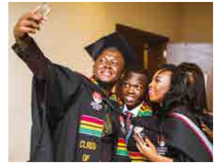
LU Ghana Graduation Selfie!

e First Student Cohort Graduation in Ghana