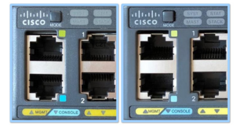
Figure 1 - Fake device on the left, Genuine device on the right

The only truly noticeable difference found was that the genuine device had a holographic Cisco sticker whereas the counterfeit products