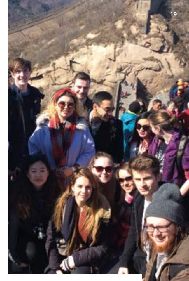
- Languages and Cultures students visiting the Great Wall in China 万里长城

You may apply to spend your International Placement Year working as a Language Assistant with the British Council. This role involves supporting the teaching of English in a school or university, planning activities and producing resources to help students improve their English as well as introducing UK contemporary culture through classroom and extra-curricular activities. You may also support the running of international projects and activities.