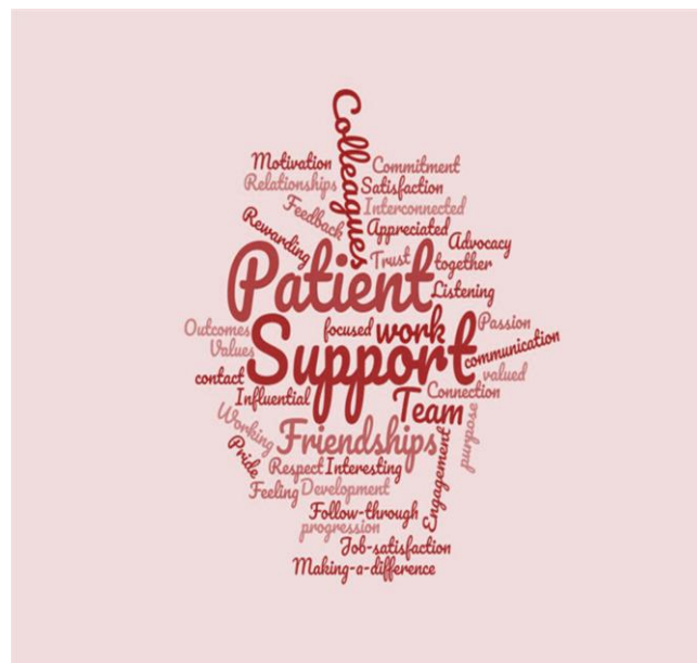
Figure 6: Capturing what employee engagement means

Managers defined employee engagement in a way that was important for their role – developing positive employee relationships in the hope this would lead to both improved patient care and positive staff wellbeing.