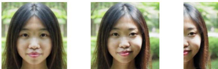
Image 1. Examples of experiment 1 stimuli. L-R: mirrored, original, right side.

Artificial Intelligence (AI) can generate highly realistic faces that are often considered indistinguishable from, and more trustworthy than, real faces. One possible explanation for this is that AI-generated faces tend to be more average-looking than real faces. Yet different AI models produce varying patterns of results—for example diffusion-generated faces are often judged to be more trustworthy but less realistic than StyleGAN2-generated faces. Therefore, it seems unlikely that averageness alone is the underlying mechanism responsible for driving both the perceived realism and trustworthiness of AI-generated faces. Instead, we propose that at least two distinct mechanisms are responsible for these effects. This project aims to explore potential mechanisms through a two-part research programme. First, we will test two cues people reported using to detect AI-generated faces in prior research—symmetry and skin-smoothness. Second, findings will be applied in a risk/reward scenario where participants must trust other players to maximise personal profit.