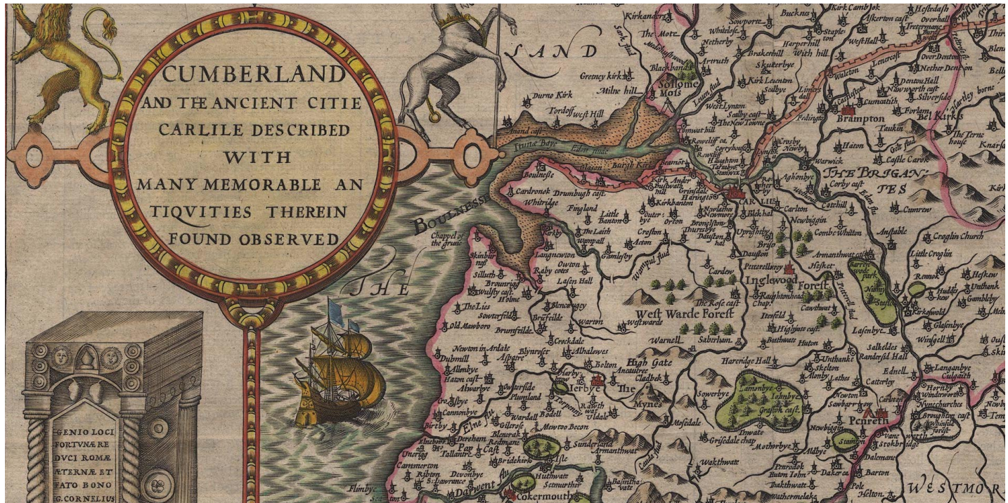
Cover image: Excerpt of John Speed Map of Cumberland 1610