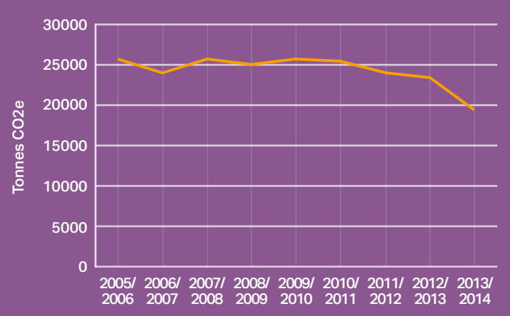
Figure 1: Lancaster University Emissions Emissions

The reduction in carbon emissions is primarily related to the on-site generation of low carbon electricity from the wind turbine and CHP, and the consequent reduction in electricity purchased from the grid.