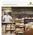
Food with thought