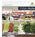
Making great food affordable

Investor relations website www.morrisons.co.uk/corporate