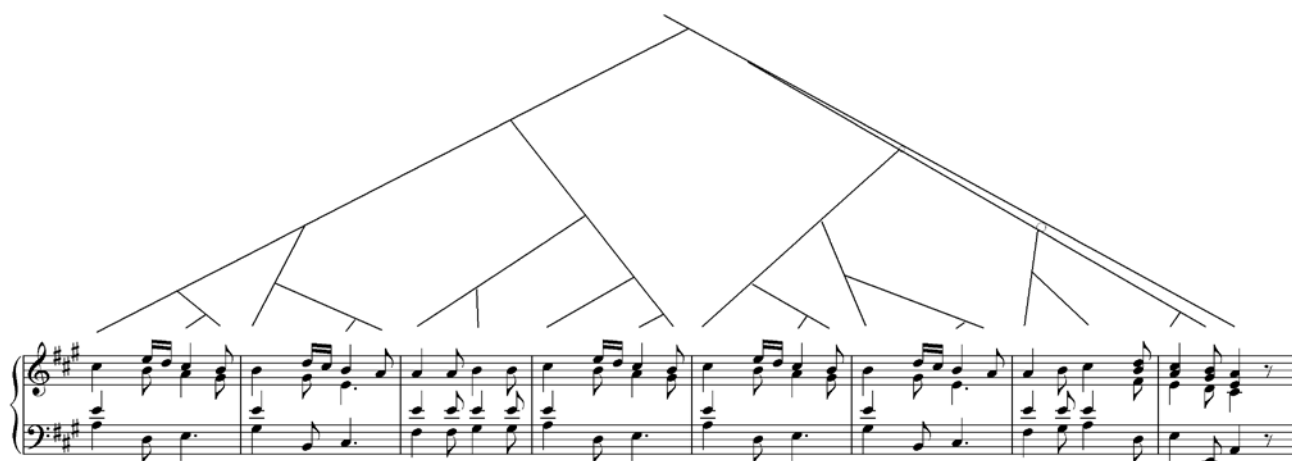
Figure 2. Recomposition of Figure 1 to place a copy of bar 4 at the beginning.

them in a precise fashion. (Instead, one is given the strong impression that only geniuses have true understanding of the laws!) Lerdahl & Jackendoff, by contrast, give a large set of rules to relate notes to analyses. However, as frequently pointed out, some of these are irregular rules in that they state only a ‘preferred’ relation between notes and structures, which need not hold if other rules imply a different relation. How conflicts between preference rules are to be resolved is not specified in the theory.