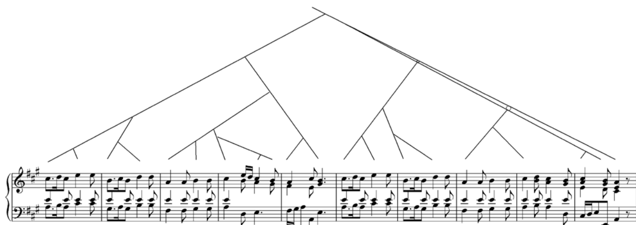
Figure 3. Recomposition of Figure 1 to make five-bar phrases.