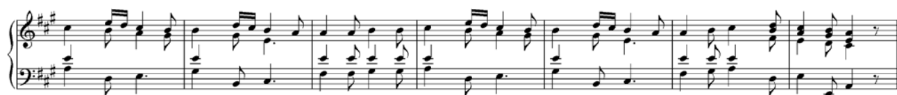
Figure 6. Recomposition of Figure 2 to prevent cadence at bar 4.

the melody note B while in bar 1 a slur would begin on the first C sharp and end somewhere beyond the end of bar 1. (In making this claim, we follow the procedure of music theorists who rely on their own intuition about the structure of a piece of music, tested by repeated listening and introspection. We furthermore assume that other listeners will have the same intuitions as ours. We judge that for our present purposes the cost of proper scientific listening tests is not warranted, but we would be interested to hear if other listeners do not share our intuitions.)