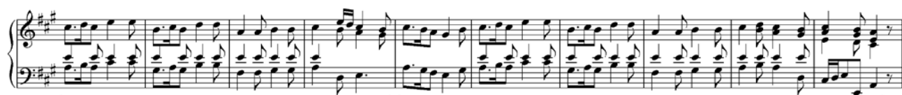
Figure 5. Recomposition of Figure 3 to recreate four-bar phrase.