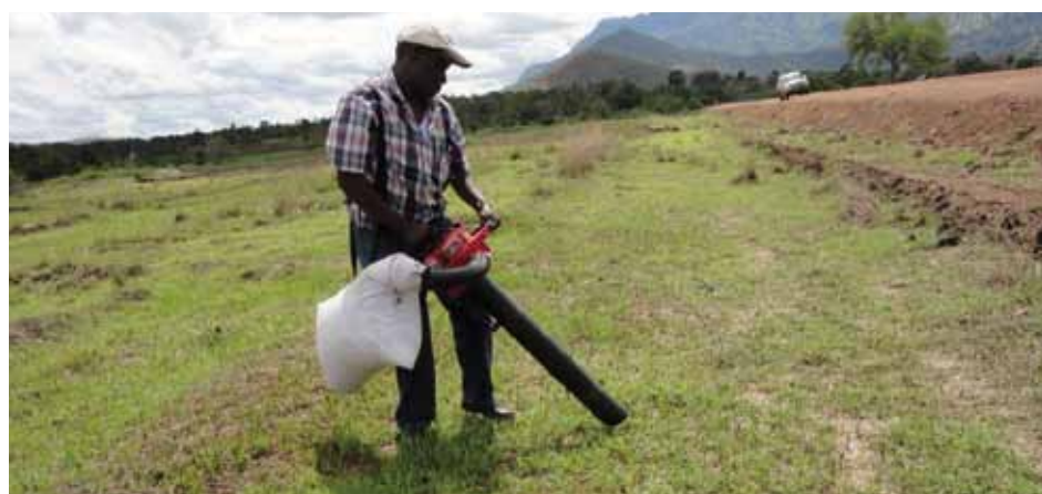
Harvesting infected larvae to produce a biopesticide.