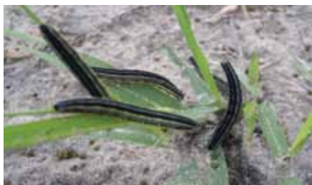
Armyworm caterpillars devastate important food crops across entire countries.