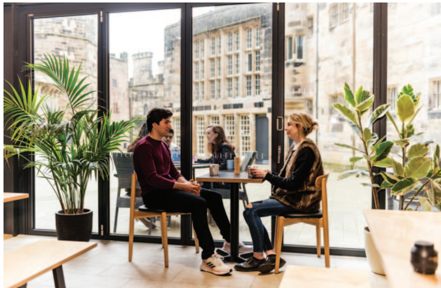
The Castle Café – Lancaster Castle