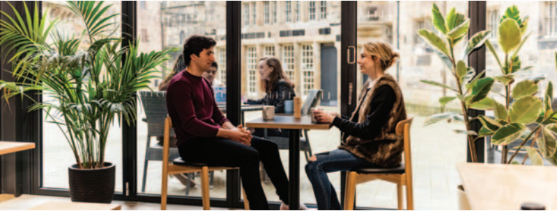
The Castle Café – Lancaster Castle